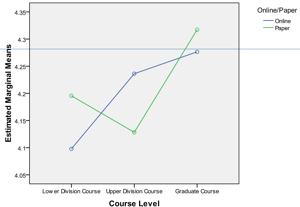
Estimated Marginal Means of 2. Used assignments to enhance learning